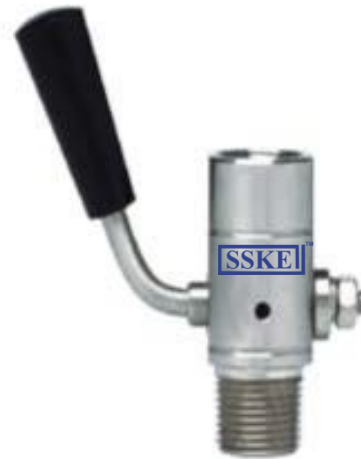
GAUGE COCK -2WAY & 3 WAY ,SSKE30-1